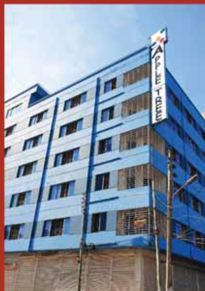
Senior Campus Admission office A Level

Plot C 11, C 12, C13/1, Road 1/1, Block Ka & Kha, Mirpur 6, Dhaka-1216