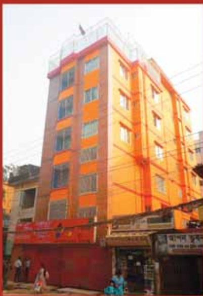
Primary Campus Admission office Playgroup - Grade 9

House 15, Road 7, Mirpur, Pallabi, Dhaka-1216