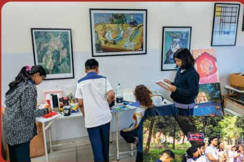
The Art and Craft club visits the National Zoo