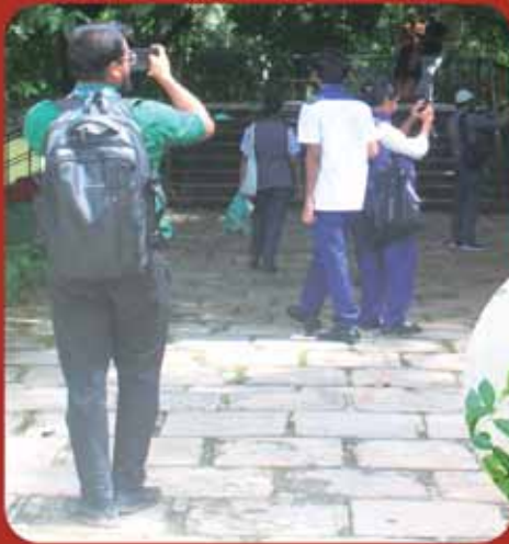
The Photography club visits the Botanical Garden